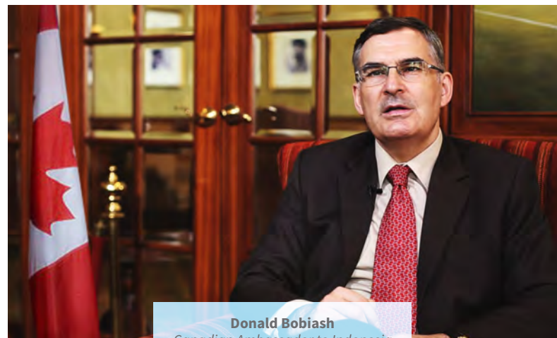
Donald Bobiash Canadian Ambassador to Indonesia

I would like to congratulate the Government of Indonesia for the successful implementation of SPAN