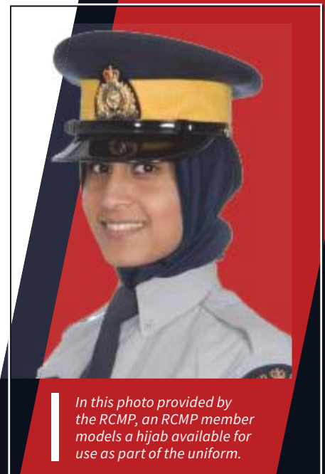
In this photo provided by the RCMP, an RCMP member models a hijab available for use as part of the uniform.

While this move is on a national scale, the RCMP are not the first police force to allow the use of the hijab in Canada. The Toronto police force were the first police force to allow the use of the Hijab in Canada in 2011 followed by the Edmonton, Alberta police force in 2013. Additionally, this is not the first time the RCMP has taken an international leadership role in terms of diversity. In 1990, after a legal victory, the RCMP approved the turban as part of the uniform for Sikh officers.