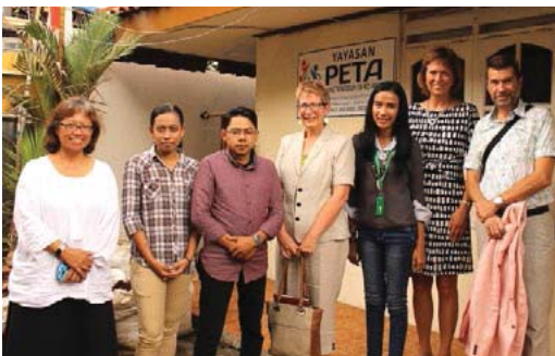
Canadian MPs Doug Pam Damoff, Douglas Eyolfson and Brenda Shanahan visited a school and a health centre participating in MI's programs as part of a visit to Indonesia organized by RESULTS Canada.

Through the Right Start Initiative in Indonesia — with the support of the Government of Canada — MI will reach 18.8 million women of reproductive age and adolescent girls in Indonesia with better nutrition through WIFAS and wheat flour fortification by 2020. MI also supports the implementation of MITRA, a multi-government program which aims to improve health and nutrition services in 20 high priority districts of Indonesia's East Java and East Nusa Tenggara provinces.