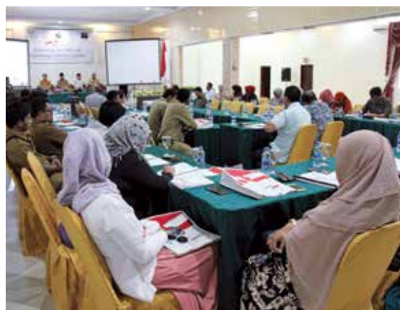
Training for coffee SMEs on how to export to Canada held in Takengon in March 2017.

TPSA also offered support with website development. Foreign buyers demand that SMEs have a functioning and informative website to support exporting. The TPSA communications specialist provided guidelines for what to include on a website to best meet foreign buyers' needs and offered best practice examples.