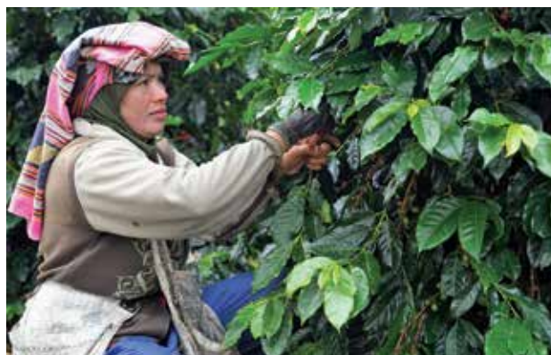
Picking coffee cherries.