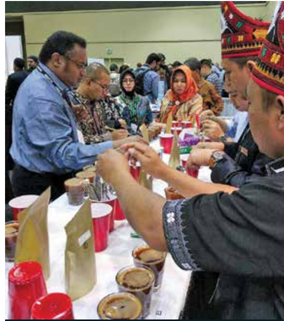
TPSA-supported coffee producers at their first international trade show.

The total sales by the five SMEs attributable to TPSA interventions amounts to C$4,775,000. Of that amount, C$1,348,000 came from Canadian buyers and the remainder from U.S. buyers. Another C$811,000 in product was sold to Canadian buyers by non-targeted coffee producers introduced to the buyers by TPSA during the 2018 buyer mission.