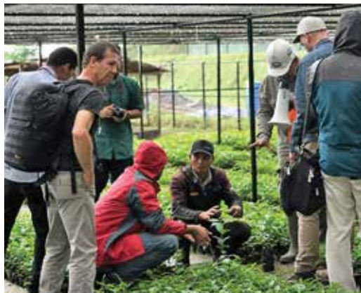
North American coffee buyers visit coffee producers in Aceh, Indonesia.

Increased relations with their only North American business partners. Gained a better understanding of the restrictive effects of their distribution scheme. Now makes better use of scientific data and CSR in promotion strategies.